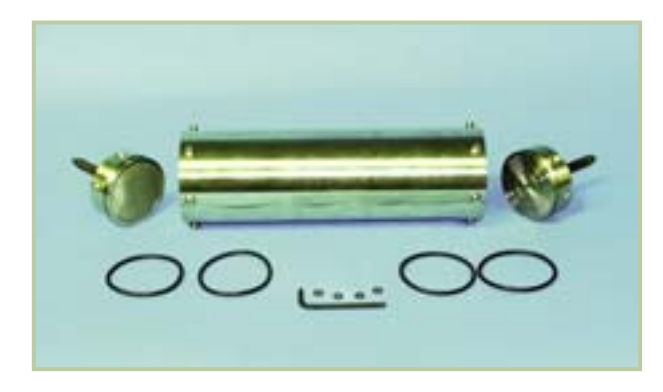
#171-29 Cell Assembly for Ceramic Disks, 500 mL

HTHP DOUBLE-END CELL ASSEMBLY FOR CEMENT TESTING, 500 ML, 10" (25.4 CM), 303 STAINLESS STEEL, 2,000 PSI #171-19